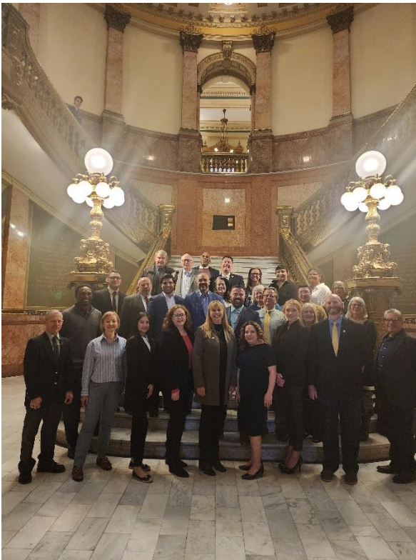
CoSEA Members and Guests at the State Capitol